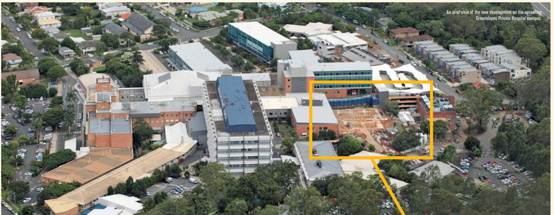
An aerial view of the new development on the sprawling Greenslopes Private Hospital campus.