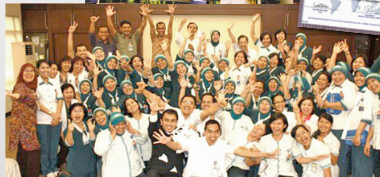
ABOVE: Staff at Premier Jatinegara celebrate their JCI achievement.